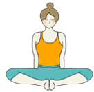
Baddha Konasana Arms Behind