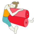
Upavishta Konasana Bolsters