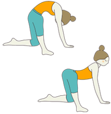
Bitilasana Marjaryasana With Leg To Side